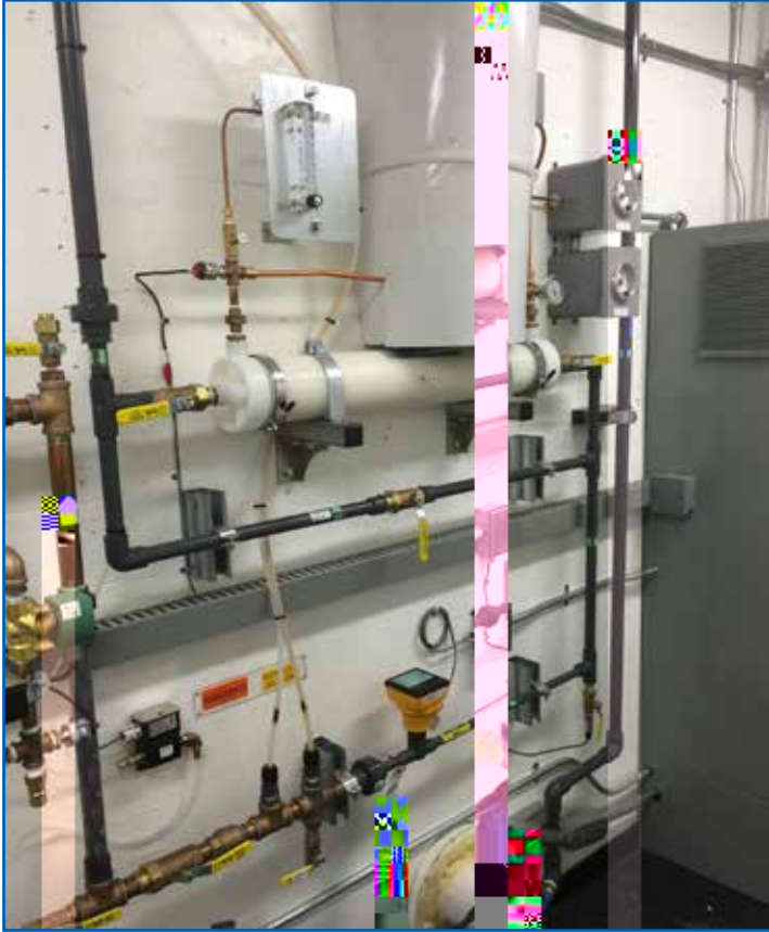
Groundwater injection system components.

As part of construction of the groundwater treatment system, Lockheed Martin removed more than 3,000 cubic yards (about 200 truckloads) of contaminated soil and hauled it to a licensed landfill. Clean soil was added to replace the contaminated soil that had been removed. The groundwater remediation program also includes land-use controls such as deed restrictions to prevent groundwater use, and monitoring for—and as necessary, removal of—contaminated vapors that might intrude into the indoor air